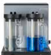
DI-110-A, KjelROC Scrubber