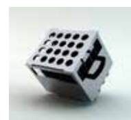
DI-052-A, Washing Lid 10 DI-053-A, Washing Lid 20

DI-211-A, KjelROC Digestor Auto 10 DI-220/221-A, KjelROC Digestor Auto 20