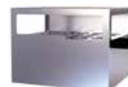
DI-010-A, Rack 10 DI-020-A, Rack 20