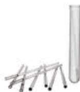
TU-222-A, Boiling Rods