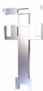
DI-050-A1, Cooling stand 10 DI-050-A2, Cooling stand 20 to mount on Digestor Auto, for both Tube Rack and Exhaust

The KjelROC Digestion portfolio offers something for most labs