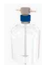
DI-111-A, Water Trap for Liquid Digestion

Our standard advanced Digestion block with motor lift. one rack and exhaust included.